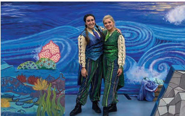
The Little Mermaid