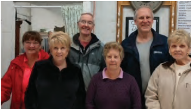
Flea Market Volunteers