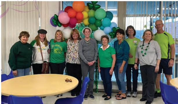
HALO St. Patrick's Day party